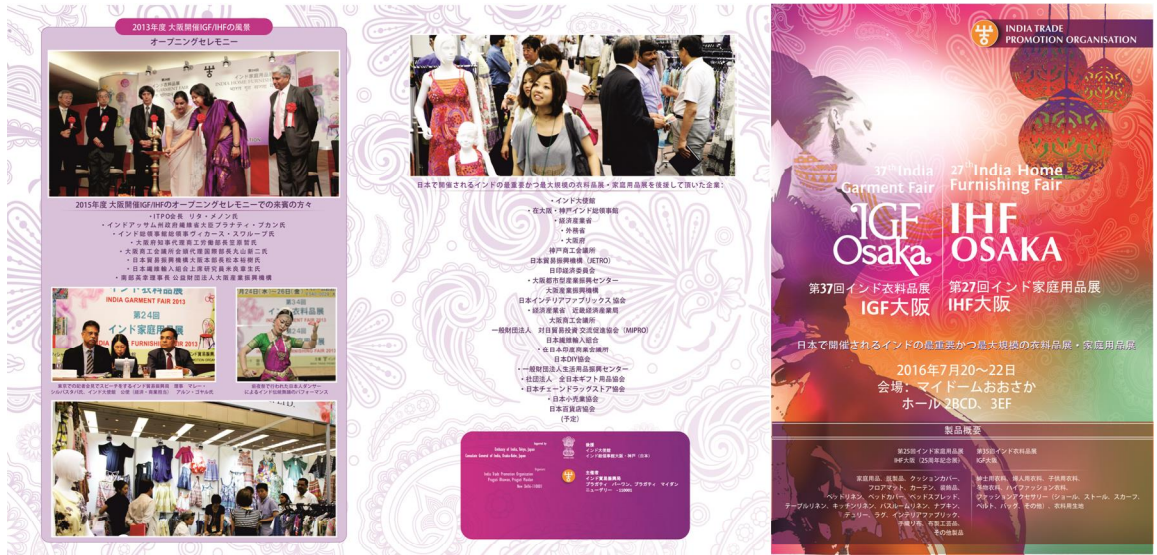
Tentative design and sample copy of :- (Fair Catalogue Supporting Organizations --inauguration ceremony)