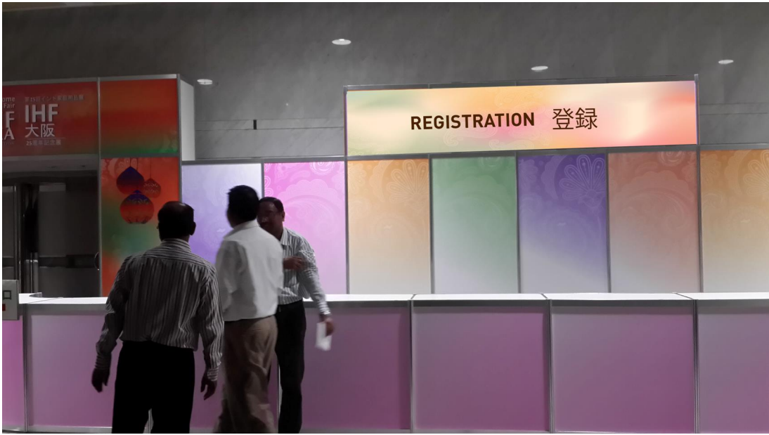
(Tentative design of Registration Desk)