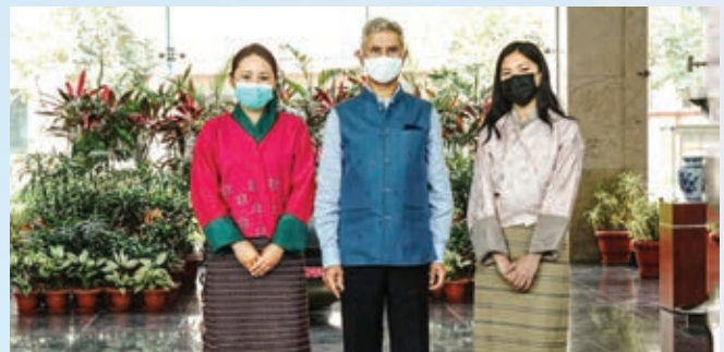
EAM with Bhutanese OTs