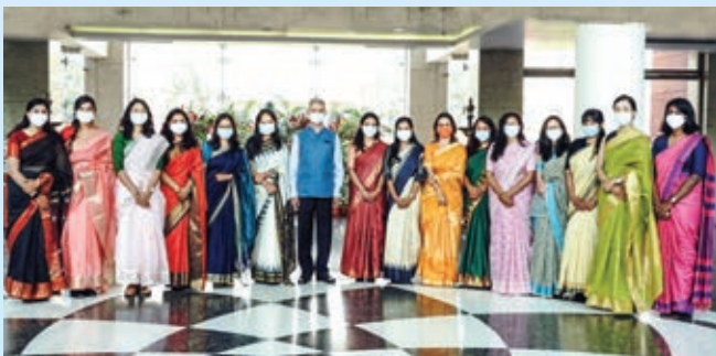
EAM with women IFS OTs 2021 Batch